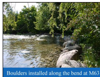
Boulders installed along the bend at M63