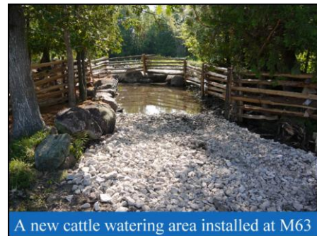
A new cattle watering area installed at M63

A restricted cattle watering area was installed on the river bank. Cedar rail fencing was installed parallel to the river with the help of the Ontario Rangers from Killarney Provincial Park and the Manitoulin Stewardship Rangers.