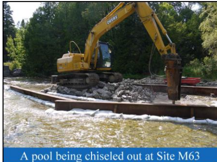
A pool being chiseled out at Site M63