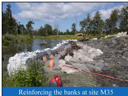
Reinforcing the banks at site M35

Rehabilitation and reinforcement of the bend in the river is the main focus of this site. The job was carried out by Ferguson Aggregate and Construction with site designs by Great Lakes Environmental Services. There will be sixty-four (64) boulders accompanied by sixty-two (62) root wads used in this bank stabilization.